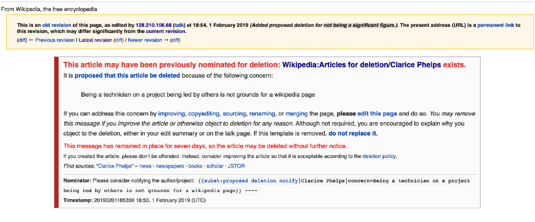
Fig 08 – One of the biographies that generated most media coverage. The page was deleted twice, protected against creation, considered in three deletion reviews, one Arbitration case and overall intense discussion about meeting a notability standard (Wikipedia, 2020).

Alongside the flagging, Wikipedia is interesting to analyse for their other software tools. Without assigned moderators, the task to edit content on Wikipedia articles is the result of the public collaborative discussion between users. As anti-hate measures, the editors get help from tools such as ClueBot NG, ORES or the AbuseFilter extension. These software tools detect and remove hateful content. The tools are always evolving to more sophisticated forms, for example, with the implementation of machine learning. The automatisation of moderation is becoming a common practice on social media. But so far, the intricate nature of hate and its context, still require a lot of human action. Until someone comes up with better social solutions, technical tools can help users to deflect hateful content.