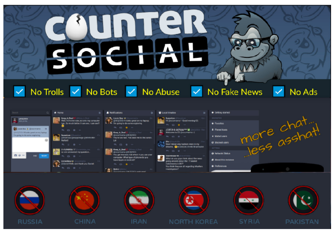
Fig 05 - Rules on Counter.social (Counter.social, 2020).

It's important to understand that user rules don't follow any particular view on morality. For example, CounterSocial is another instance on the platform that blocks entire countries, such as Russia, China, Iran, Pakistan or Syria. The instance asserts that blocking countries aims to keep their community safe by not allowing nations known to use bots and trolls against the West . It can seem dubious behaviour, but this is entirely legitimate on Mastodon. I'm laying out these examples to highlight the diversity of approaches inside CoC documentation. The community is independent to create its guidelines; they choose who to invite and block from their network. The last question of CounterSocial frequent questions says it all: "Who defines these rules, anyways?" It's them.