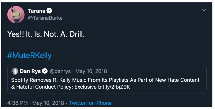
Fig 01 – Activist of the #MeToo movement tweeting #MuteRKelly (Burke, 2018).

People were encouraged to boycott him by sharing #MuteRKelly in all platforms. Report or perform similar actions on music streaming services, post about it as much as one could. At this time, Spotify removed R. Kelly from the auto-generated playlists and introduced the button don't play this artist across the platform. Some users were calling it the R. Kelly button , as the moment for the release of the feature, seemed very connected with the boycott. Later, Spotify reversed all decisions. According to Spotify Policy Update of June 2018, "[At Spotify] we don't aim to play judge and jury." The apprehension from Spotify to act adds to the discussion about the role of social media businesses: does it fall onto the users or the platforms to fight the problematic topic of hate speech? Do commercial platforms benefit more from conflict?