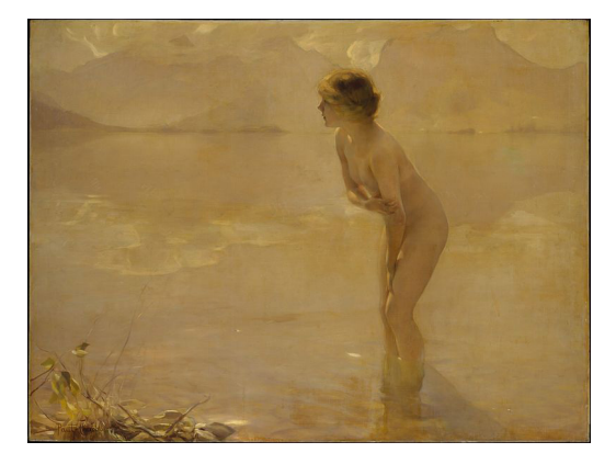
Fig 02 – Matinée de Septembre (Chabas, 1911).

Unfortunately, conflict and hate draw attention. There is a term used in the art world for such a phenomenon: succès de scandale is a french saying from the Belle Époque in Paris, meaning success from scandal. The expression applies to Paul Chabas work in 1911, when he painted Matinée de Septembre portraiting a nude woman in a lake. The nudity of the piece caused controversy, and several complaints culminated in a court case against the public exhibition of the painting. The discussion was dramatic. City council was making laws to prohibit nudes; meanwhile gallery owners were purposely placing copies of Chabas' work on their windows. This increased the public's interest in the controversial painting. The example of the growing popularity of this painting shows how hate and nudity both generate controversy and thus spectacle. Scandals are easily monetised, and restrictions may only create more interest in a subject, in the art world or on social media.